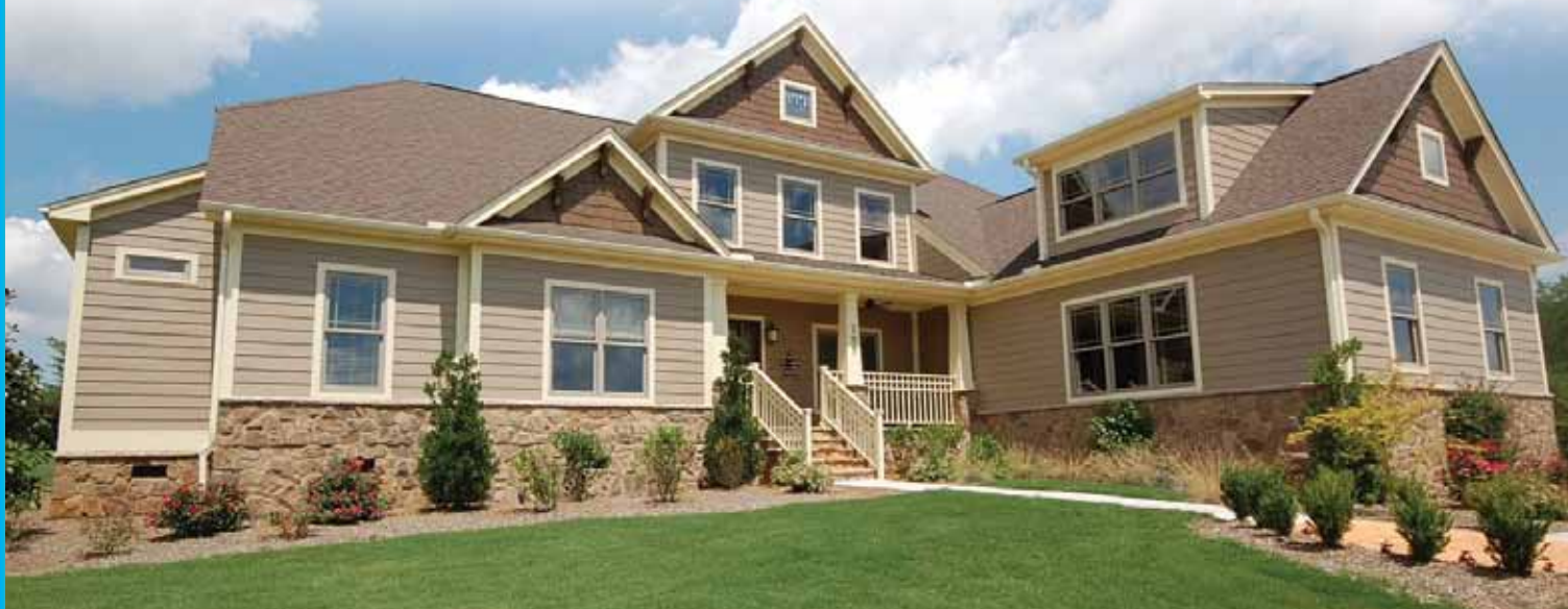
THE CHATHAM A