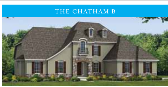
THE CHATHAM B

This elegant two-story home combines functional living areas and sophisticated spaces for entertaining. The spacious first floor owners retreat includes his and her walk-in closets and double vanities. The kitchen is open to the morning room and the keeping room which features a fireplace. The patio doors in the morning room lead to an optional covered porch, which is perfect for indoor and outdoor entertaining. The formal dining room is great for family gatherings and the study with double doors provides a private area within home. The second floor includes three bedrooms, three bathrooms and a loft overlooking the keeping room.